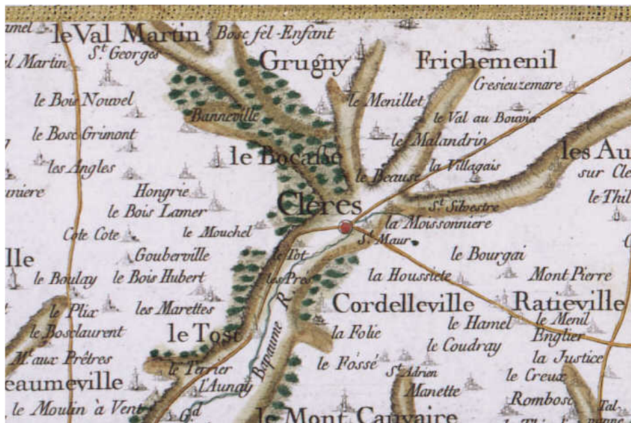
Figure 1: Clères. The late 18th-century map of Cassini.