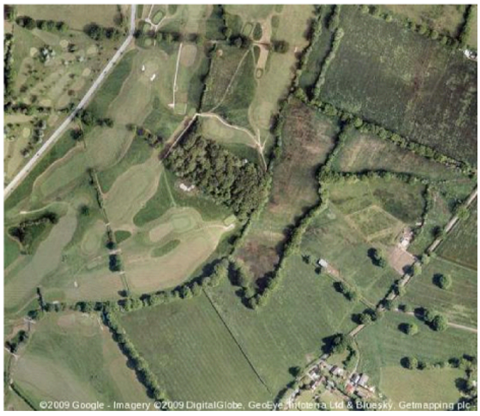
Figure 1: Durley, Hampshire, with the site of cuntan halh in the centre.

Gropecuntlane : This street-name is recorded in about twenty places; all have now become Grape Lane or similar, or have been completely lost.