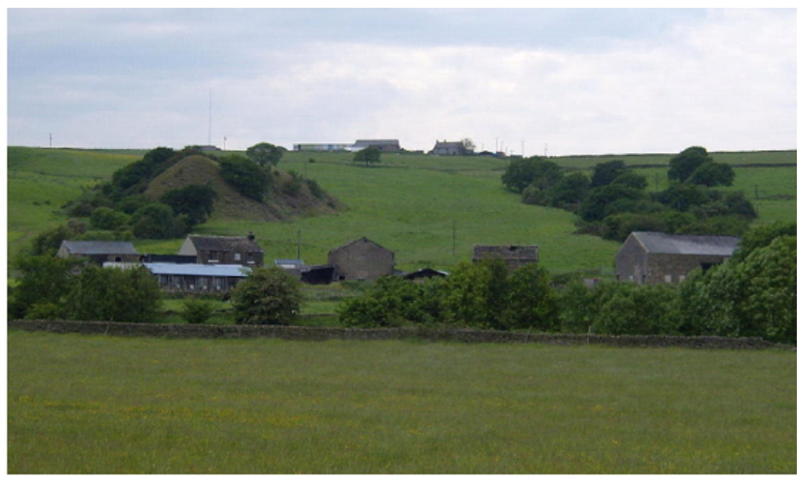
Figure 3: Lower Cunliffe (Lancashire), showing the two wooded gullies, with a spoil-heap partly obscuring the left-hand one.

Consideration of this name is complicated by the apparent existence of a variant cunliff of cundiff , cundreth 'conduit, sewer' (EDD: s.v. cundy). The word is either a direct descendant of 'conduit' with parasitic -r-, later altered to -l-, or a compound with OE r\bar{\imath}\delta , ME rithe 'stream'.