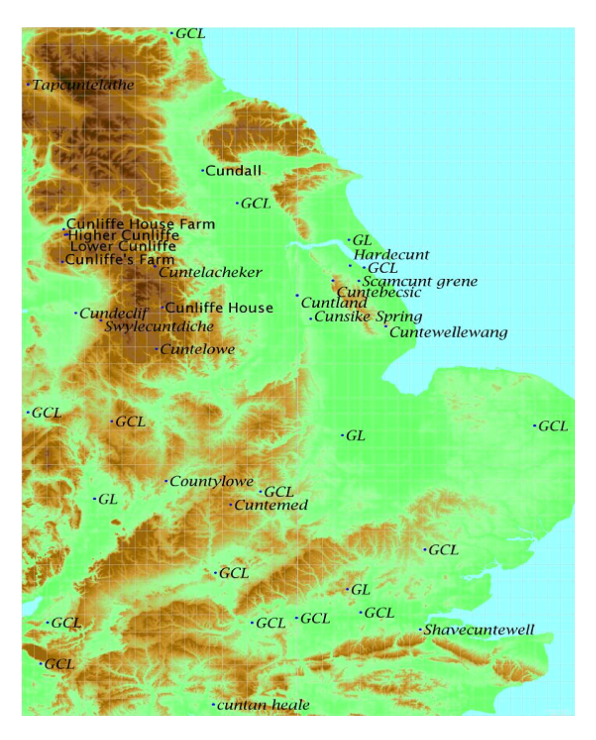
Figure 2: Location of names considered in the text. GCL = Grope cuntlane, GL = Grope lane.