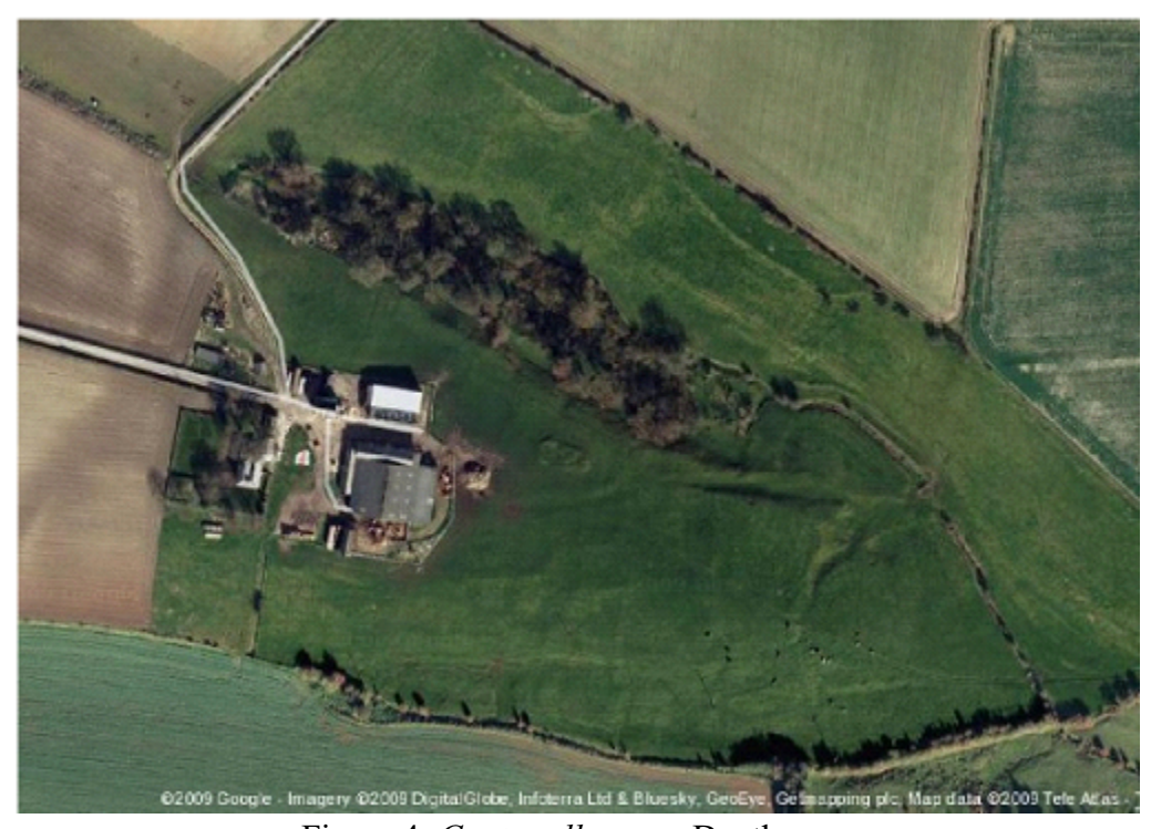
Figure 4: Cuntewellewang, Dexthorpe.

This is a remarkable isolated cluster of six names in Lincolnshire. In most cases no exact feature be precisely identified, but a topographical interpretation is likely for all of them. Cuntewellewang in Dexthorpe is surely a description of the narrow wooded valley at TF 406 716 (Figure 4). Though no early record of any of these places survives, an origin in the Scandinavian word is very probable, and this group might be considered as evidence that ME cunte derives from Scandinavian. The generics in these names are ON bekkr 'stream', sik 'ditch, channel', and vangr 'field'. The use of cunte as a generic in Hardecunt is unique. Cameron, Field, and Insley (PN L 5: xvii) suggest that the last name may contain ON skammr 'short'; ME sc(h)ame 'shame' seems another possibility, though the spelling scam without -h - is unusual for a date as late as 1457. We may compare here OE scamlim 'limb of shame', a gloss for Ueretrum (Quinn 1956), and modern German Schamlippen , Dutch schaamlippen .