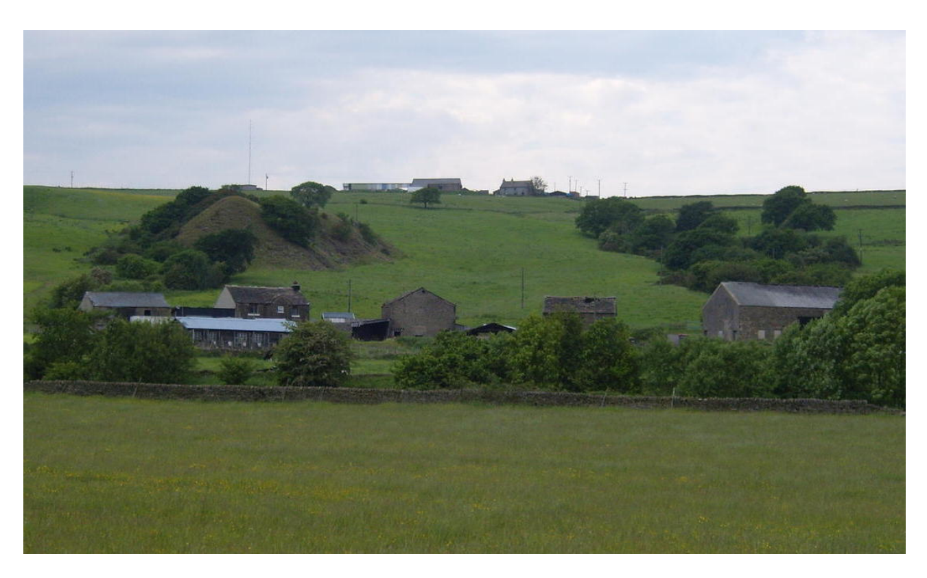
Figure 3: Lower Cunliffe (Lancashire), showing the two wooded gullies, with a spoil-heap partly obscuring the left-hand one.

The name may be topographical (as Cuntewelle(wang) below), or possibly it is a site of humiliating punishment of women. There is further discussion of related folkloric issues in Jones (2002: 251).