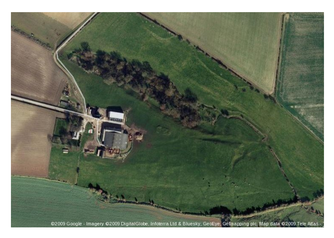
Figure 4: Cuntewellewang, Dexthorpe.