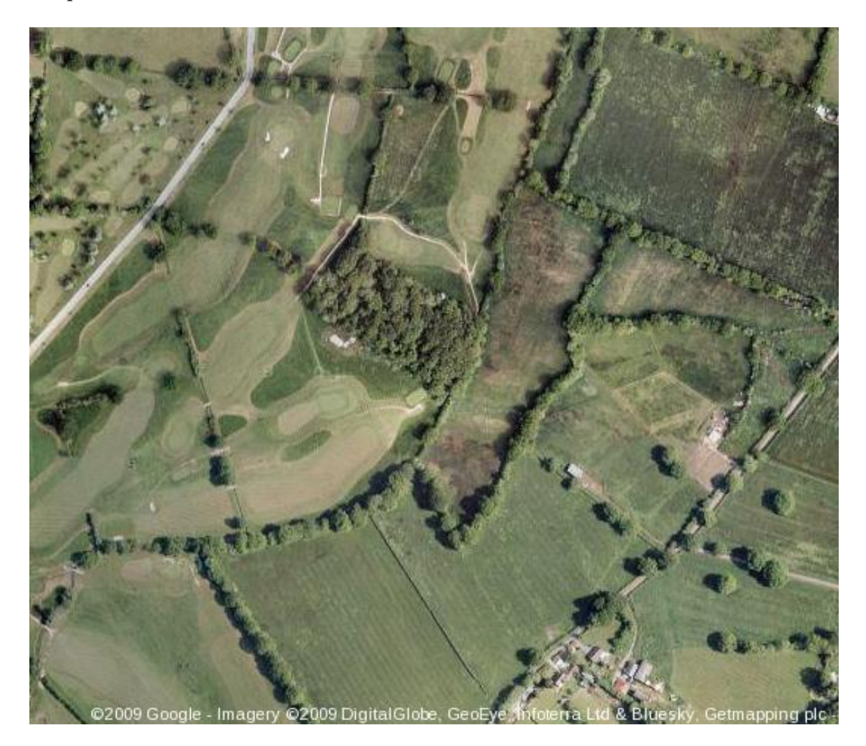
Figure 1: Durley, Hampshire, with the site of cuntan halh in the centre.

Grundy (1924: 82-86) avoids giving a translation, but just writes "... hollow"; for Brooks (1982), the meaning is 'cunt-hollow'; for Currie (1995: 105) the meaning is 'Cuntan's hollow', a grammatical impossibility; while for Miller (2001: 25), it is 'cuntish hollow'. On page 233, he states "This word occurs in Old English only in the phrase cuntan healh ". This is thus the only recorded pre-Conquest use of the word [5] [6].