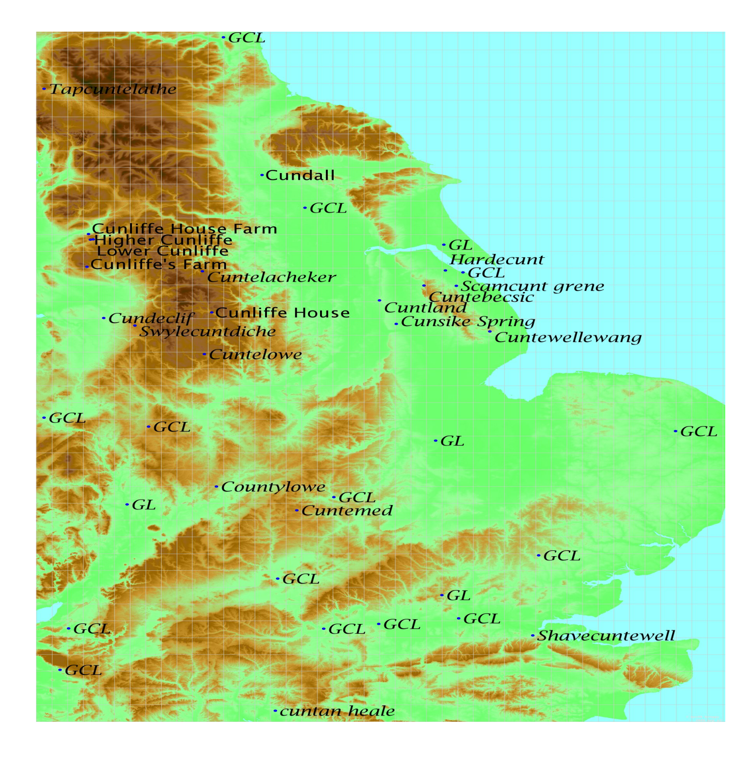
Figure 2: Location of names considered in the text. GCL=Gropecuntlane, GL=Gropelane